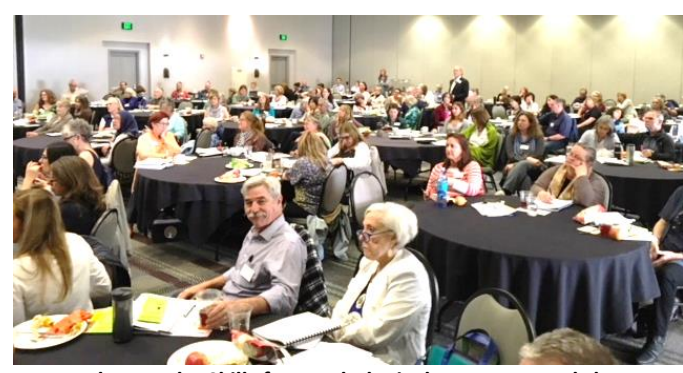
Attendees at the Skills for Psychological Recovery workshop on April 21 and 22. It was a very good training with lots in attendance.