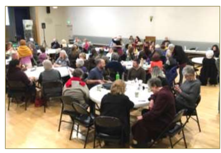
SOCIAL TIME BEFORE START OF MEETING

THERE IS LOTS OF HELPFUL INFORMATION AND ALSO VIDEOS OF OUR PRESENTERS YOU CAN WATCH AS A MEMBER. THERE ARE DOWNLOADS FOR MAKING A PROFESSIONAL WILL AND MORE.