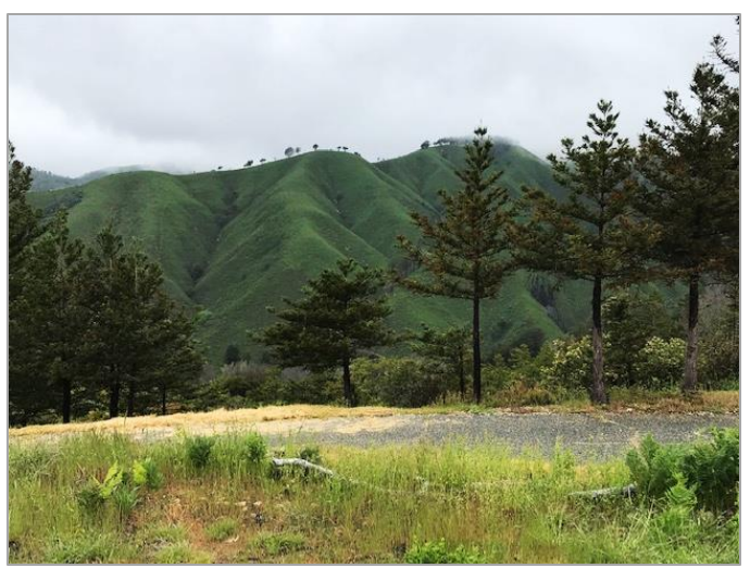
Looking north in Big Sur from my friends' house.

them heal and learn how to connect again. We are so fortunate to have M.E.N. here and access to Breakthrough for Men online. Send them. It helps tremendously.