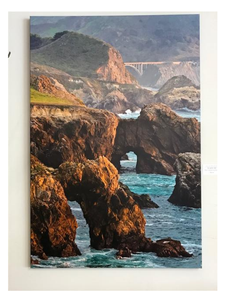
This is a picture of the picture of the Big Sur coast at the entrance to Palo Colorado Canyon. It hangs in my bedroom. That is Bixby Bridge in the background.